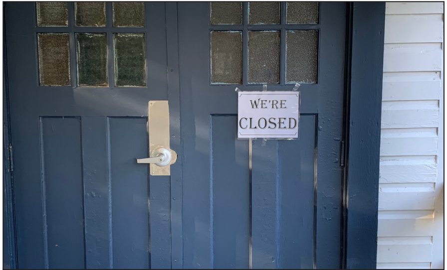
Doors to Halbe Hall in Black Creek where Local 230 Courtenay and Campbell River Unit members meet.

On a positive note, after many hours of hard work, IBEW 230 has been accredited by Technical Safety BC for online delivery of the 8hr code update.