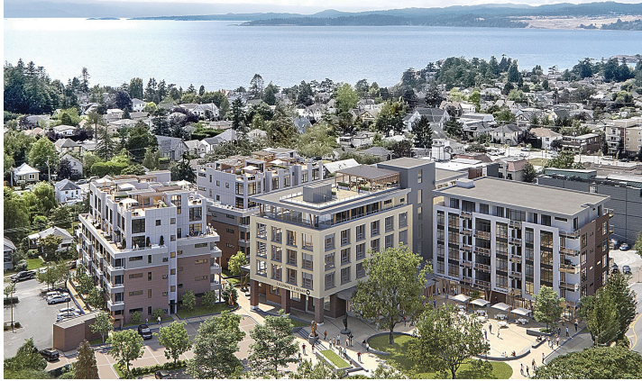
Esquimalt Town Square Construction Moving Forward Aragon Properties Ltd.

Esquimalt has a long history that dates back to the First Nations people approximately 4000 years before European Settlement in the late 1700s. The original town has disappeared within the Canadian Forces Base and little of the village heritage remains. Today, the township is characterized by its proximity to downtown and its mix of commercial, residential and industrial development. The area is home to some of the largest employers on the South Island such as CFB Dockyards and Seaspan's Victoria Shipyards, which together employ approximately 400 Local 230 members.