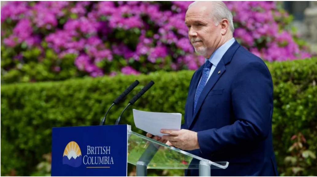
Premier John Horgan pictured on June 11, 2020 speaking about COVID-19.

With the BC General Election fast-approaching, I would like to remind you that it is your right and civic duty to vote. We often forget that there was a time in Canadian history when not all individuals were allowed to vote. Voting is a way for your voice to be heard and you'd be mistaken if you didn't think your vote is meaningful! I realize that politics and elections can be convoluted and overwhelming, especially with an influx of information available from social media, the news and people around us. For that reason, I'd like to take the opportunity to shed some light on the two parties that will most likely form the next majority government, the incumbent New Democratic Party (NDP) or the BC Liberals.