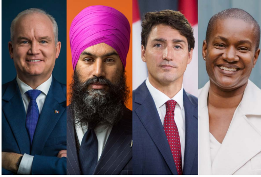
Left to right: Erin O'Toole, Conservatives; Jagmeet Singh, NDP; Justin Trudeau, Liberals; Annamie Paul, Greens

While the Island is expected to stay NDP strong, we know there is no chance they'll be having an election win. In a Liberal minority government, we saw that the NDP had strength and leverage which led to many positive changes for workers. As always, I urge you to gather information on your local candidates to make the best informed decision you can. Do not be fooled by cyber garbage and don't believe everything you see on social media. People will use anything as ammunition which may have nothing to do with the parties' policies. Think of the next four, ten, or even twenty years in terms of your safety, health, job security, and family.