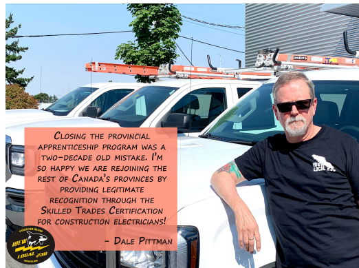
Shop Steward, Island Temperature Controls

BC's Premier announced that Skilled Trades Certification is an important government initiative, and will be introduced in the coming months for 10 Skilled Trades. British Columbia had 11 "compulsory" trades, originally introduced in the mid-70's by the Social Credit government as "Designated Trades". Then in 2003 the BC Liberal government was duped into believing that "Red Seal" was synonymous with "red tape" and quashed the "compulsory" requirement deregulating the Province's Apprenticeship system.