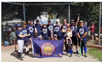
Local 230 Live Wires Slo-Pitch Team

This summer was also the 30th annual Michael Dunahee Slot-Pitch Tournament of Hope. Our Local 230 team played on August 5th to 7th at MacDonald Park in James Bay. The tournament had been cancelled for two years during the pandemic but returns with union-sponsored teams raising funds for Child Find BC, an organization that works with police and families to reduce incidences of missing and exploited children. FMF Bolts also had a good season playing against 19 other teams in the Naden hockey league. The league has 4 different divisions with the FMF Bolts in 'A Division'. Bolts played in B Division and won the title in 2019. Formerly the FMF STARS the Bolts have been playing for 5 years now.