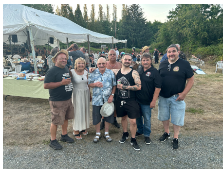
The Baskin and IBEW Local 230 Annual Pig Roast