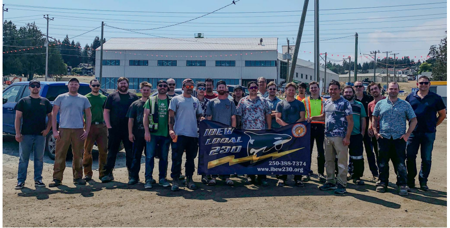
Sasco Contractors Breaking Bad at the Government's Newest Cook House

I've been a member of Local 230 for 43 years now and I don't ever recall the Saanich Peninsula as being described as having a "busy construction market," so I googled "building boom in Saanich peninsula" and sure enough, nothing came up, lol. Nothing, I searched more and still nothing, nobody has ever written about the communities on the Saanich Peninsula as having a 'busy construction marketplace' and, it doesn't look like it's ready to slow down just yet as Victoria's International Airport breaks ground on a new Control Tower, the Brentwood Bay Sewer replacement project, and the Province's mandate on increasing urban development for every community in British Columbia to help turn the housing crisis around.