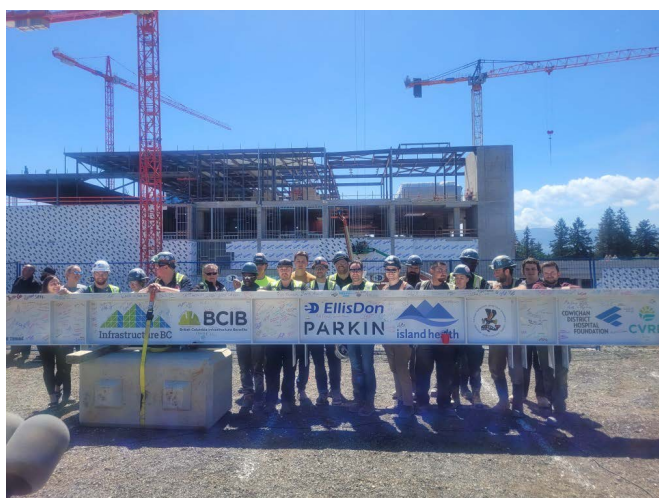
The Last Structural Beam at Cowichan Hospital with the Houle Electric Crew