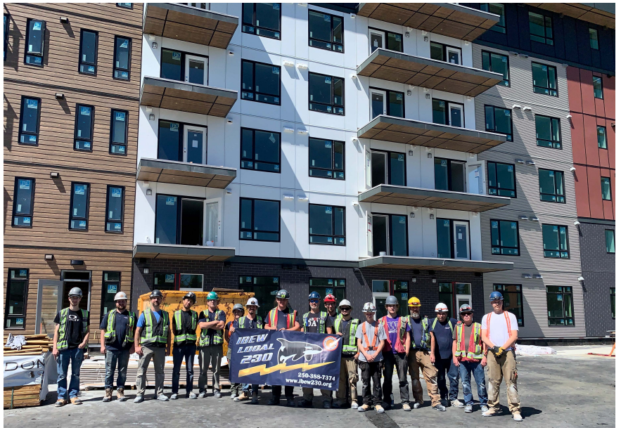
Arrm Electric Crew at Condo Project at the Old Marigold Nursery Property