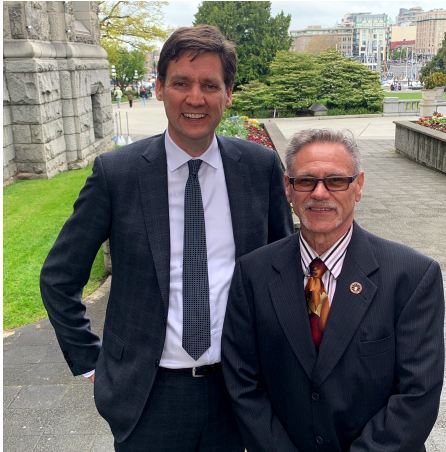
Premier Eby with Business Manager Venoit

In January 2001, I wrote to the Minister of Labour in BC to say that it was time to bring flush toilets to construction workers, after hearing the conditions on the Royal Jubilee project. "At times, the portable johns have been left in putrid neglect, often overflowing. Some workers are bringing in their own toilet paper from home..." a few short months later the BC Liberals became government, and, well, the first few years we went into defensive mode as it seemed like we were reeling from a barrage of collective agreement cuts and attacks on our labour monthly. Then, in March 2020 came along with COVID-19 and Dr. Bonnie Henry telling us we had to wash our hands to stay safe, while our construction members were deemed essential service workers.