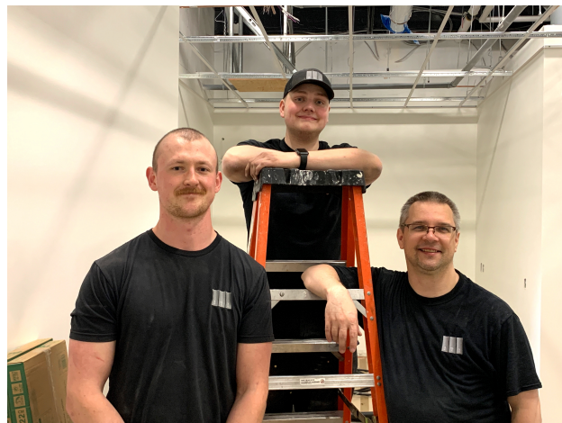
Island Technical Installations at Sidney's Newest Veterinary Clinic